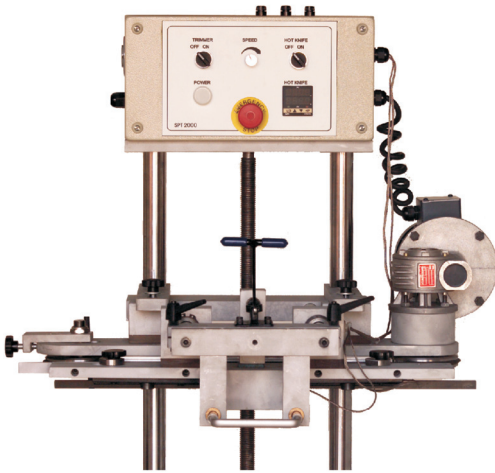
Guarding not shown.